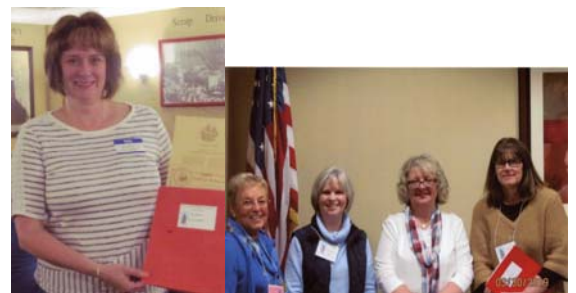
New Toledo Colony members